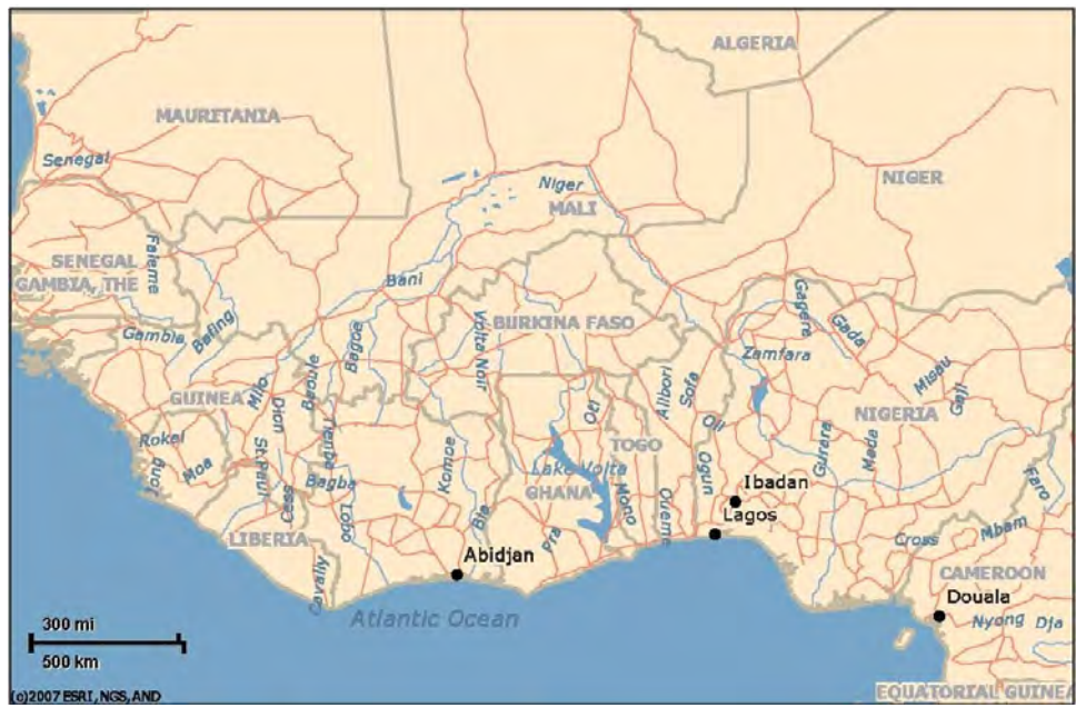
Map 1: Nigeria and neigbouring countries

the ethnically complex nation of Nigeria.<sup>1</sup> The Nigerian Government sees the education for these nomadic people as a priority, and has devoted monetary and material resources for such programmes.